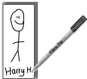
White Address Label