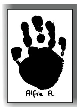
1/4 A4 White Paper